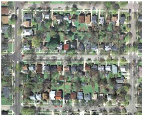
Airphoto of a neighborhood