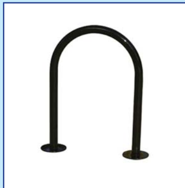
Inverted-U Style Racks