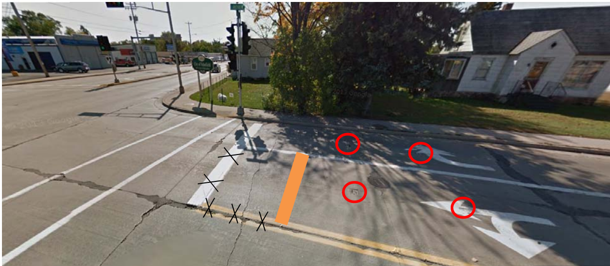
Eastbound Lake View Drive at Business 51